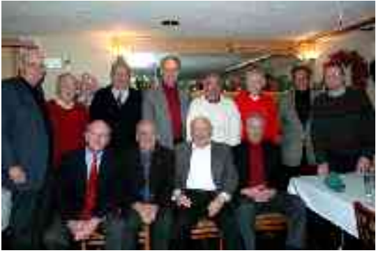
Members of the Club's Two Bowling Teams