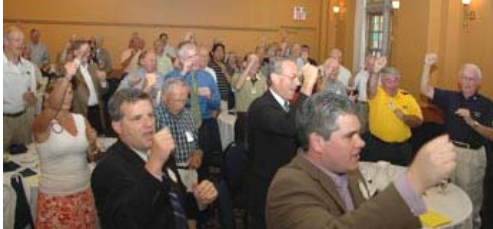
We warmed up by singing, "The Victors"